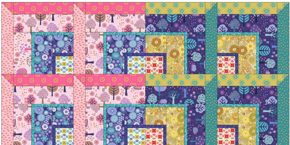
Diagram of the first two rows keep adding the row until you have all four together.

Laying out in rows, as you sew each row pressing the seam one way on the first row and the other way on the next row. This will help when sewing the rows together.