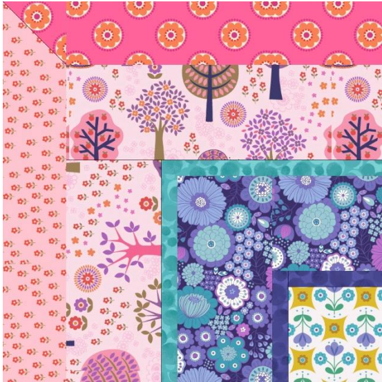
Block 1a sew four of this one