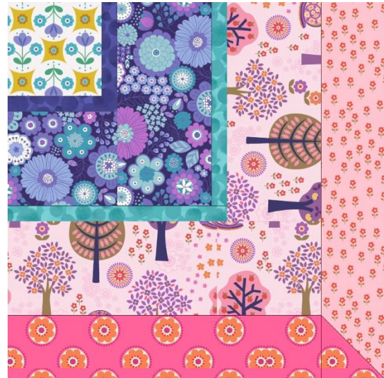
Block 1b sew four of this one