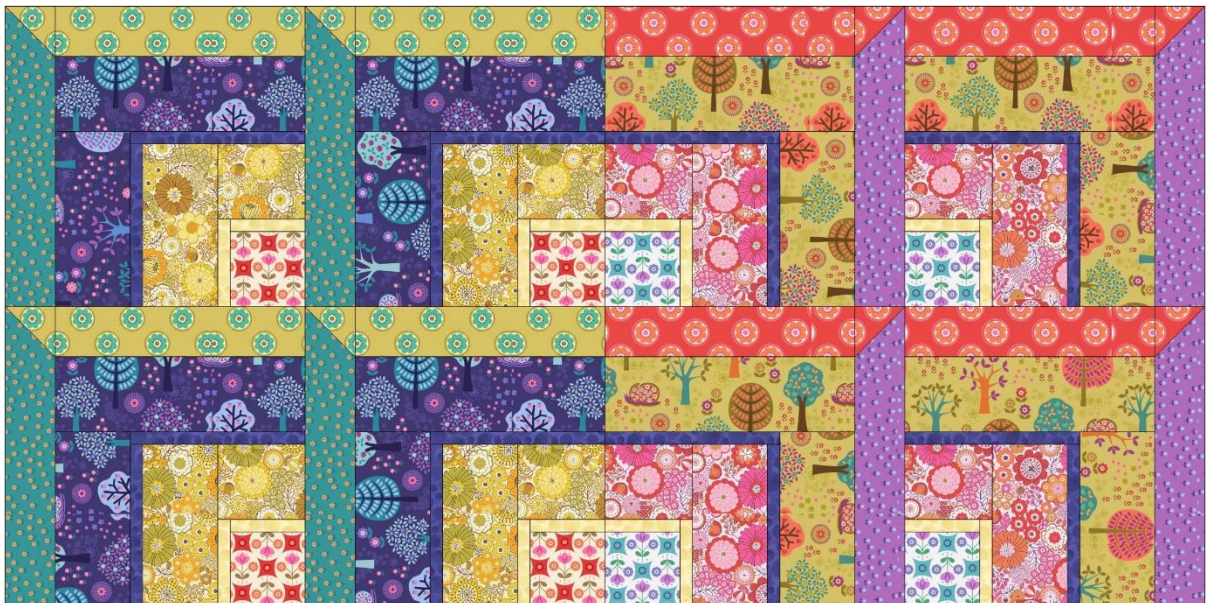
Diagram of the first two rows keep adding the row until you have all four together.

Laying out in rows, as you sew each row pressing the seam one way on the first row and the other way on the next row. This will help when sewing the rows together.